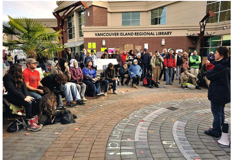
Above: General Assembly - a truly democratic experience